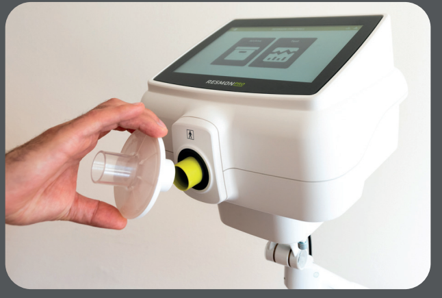
Resmon Pro Full V3 is a product from Restech srl

The Resmon Pro Full V3 is a revolutionary and validated Forced Oscillation Technique of asthma, COPD and Post-Covid patients. Testing includes fast (10 breath tidal breathing) assessment of sensitive small airways, lung recruitment and tidal expiratory flow limitation (EFL).